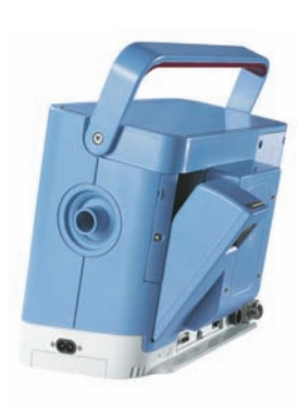
Trilogy100 features a detachable battery.

Managing home ventilator patients is challenging enough. So, the last thing you need is a complicated ventilator. Which is why the Trilogy100 provides easy-to-read, easy-to-navigate screens with clear, concise directions. It also has the option of displaying detailed readings for you or simplified screens for the patient and caregiver. Either way, Trilogy100's intuitive design allows for quick access to device settings and patient information. It also allows you to set dual prescriptions — one for daytime and a second for when your patient is sleeping.