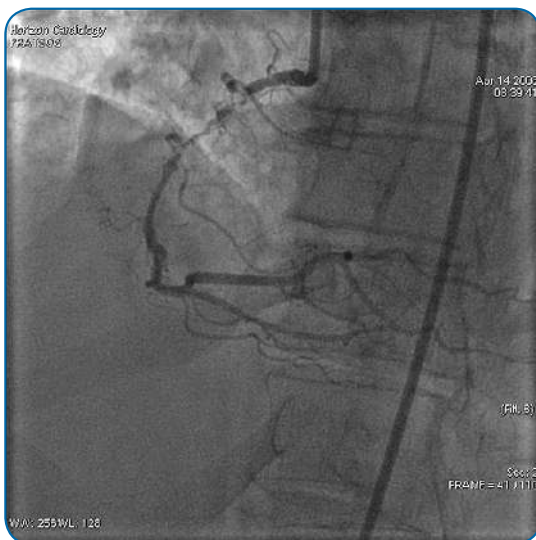
RCA Diffuse 1