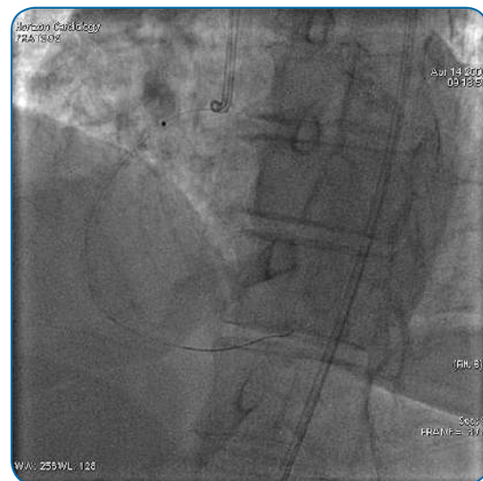
RCA Diffuse 0.9