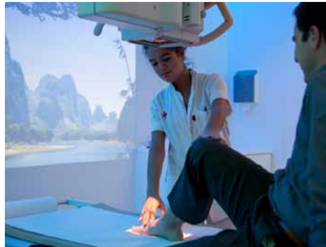
You can divert the patient's attention with soothing sounds, video projections and colored lighting.

The recently completed new building at the JBZ unites the facilities of three sites in 's-Hertogenbosch: the Carolus, the Groot Ziekengasthuis and the Willem Alexander. The hospital's aims are clear: to become the most patient-oriented hospital in the Netherlands. With these goals in mind, it is no surprise that the proposal from Philips