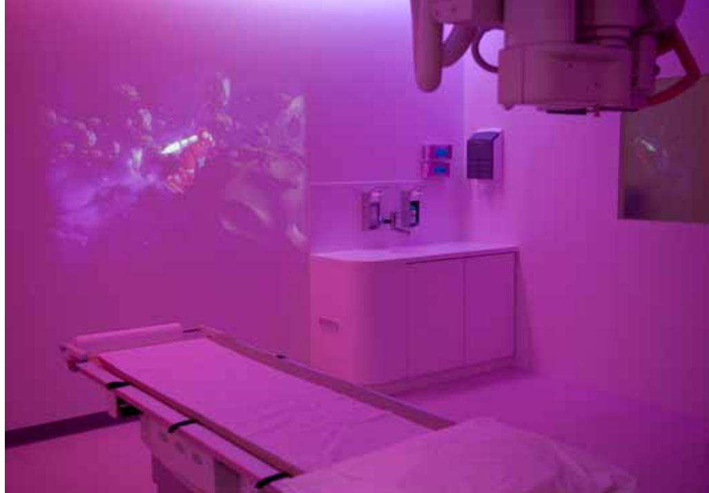
Children are mesmerized by the pleasant atmosphere.