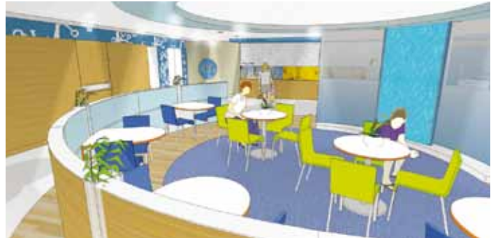
Central seating in this community area encourages socialization and relaxation. A digital waterfall provides soothing ambiance.