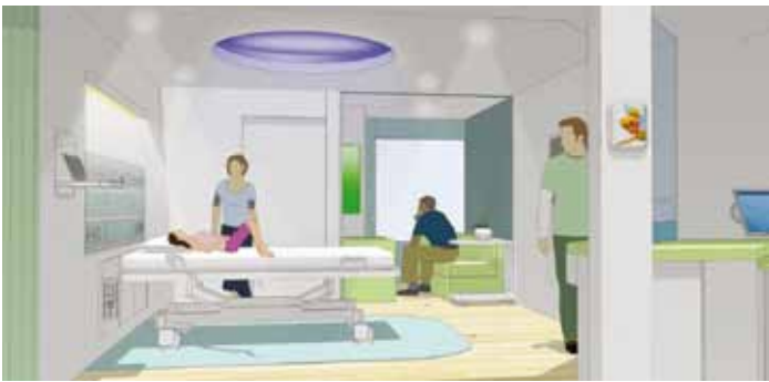
Personal ambient lighting – circular, overhead, adaptive lighting offers patients and staff the opportunity to adjust to suit the mood and procedural requirements.