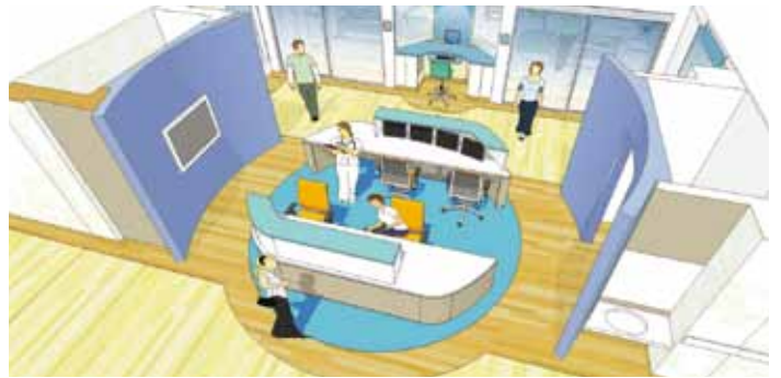
This centralized layout puts nurses and supporting staff in a communications "hub" where all resources converge to deliver exceptional patient care.