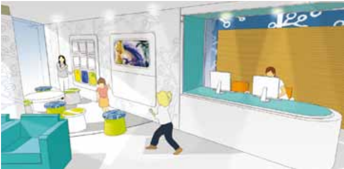
Internet access and children's play corner enables families to stay in contact with work, relatives, and their daily routine.