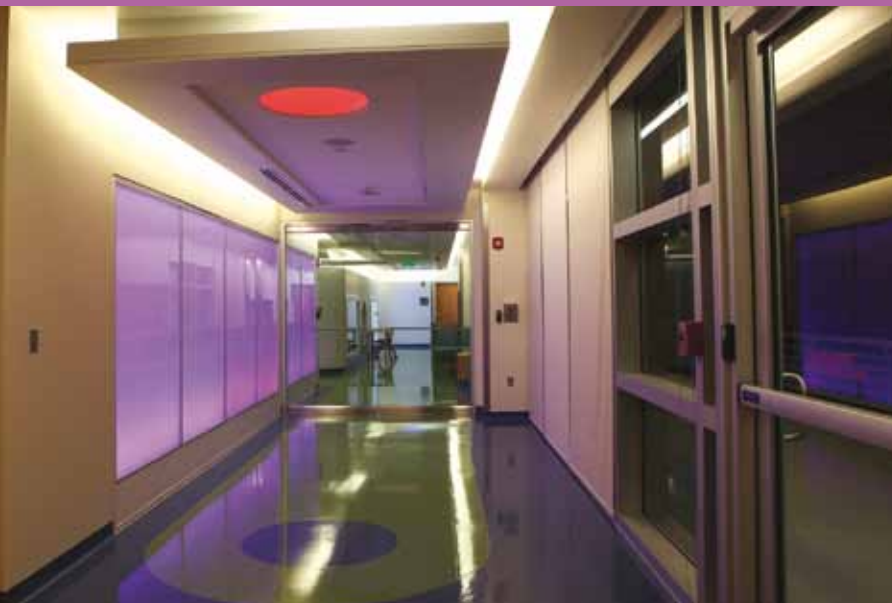
Way-finding concepts of light and color help patients transition down a corridor.