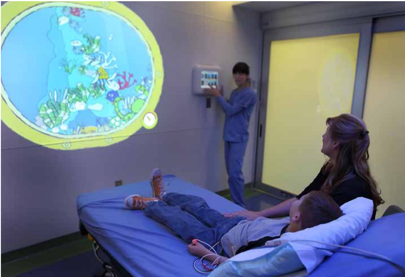
Patients can select from a library of engaging animations to help them relax.

The new Walt Disney Pavilion at Florida Hospital for Children includes a pediatric Emergency Department that stands as a case study on how the ED can be transformed by Philips Ambient Experience. Every aspect of the new pavilion exudes an attention to patient satisfaction and an example of Florida Hospital's commitment to creation of a people-centric environment.